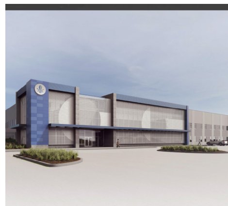
JOHN H. CARTER NEW MANUFACTURING AND REPAIR FACILITY

John H. Carter Company began operations in 1933, and provides a wide range of process automation products, services, and support for industrial, commercial, and municipal customers.